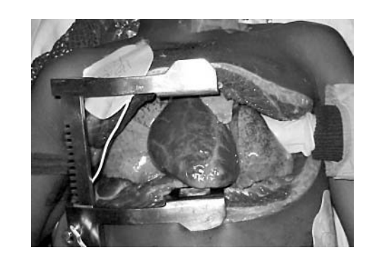
Figure 3 Open chest. Rib spreaders in situ. Central heart. In this picture the pericardium has been displaced by internal cardiac massage and lies behind the heart. Gloved hand compressing the aorta.

The procedure and equipment used to perform a thoracotomy in a cardiothoracic operating theatre is highly specialised. To