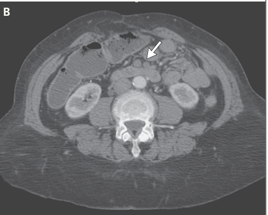
Figure 1. Computed Tomographic Angiography (CTA) in a Patient with Acute Mesenteric Ischemia Caused by an Embolism in the Superior Mesenteric Artery. This patient, who had atrial fibrillation and was not receiving anticoagulant therapy, had an acute onset of severe abdominal pain and bloody diarrhea. Panel A shows a sagittal CTA image of a long-segment occlusion of the superior mesenteric artery (arrow). The occlusion was caused by an acute embolism beyond the origin of the superior mesenteric artery. Panel B shows an axial CTA image of complete occlusion of the superior mesenteric artery.