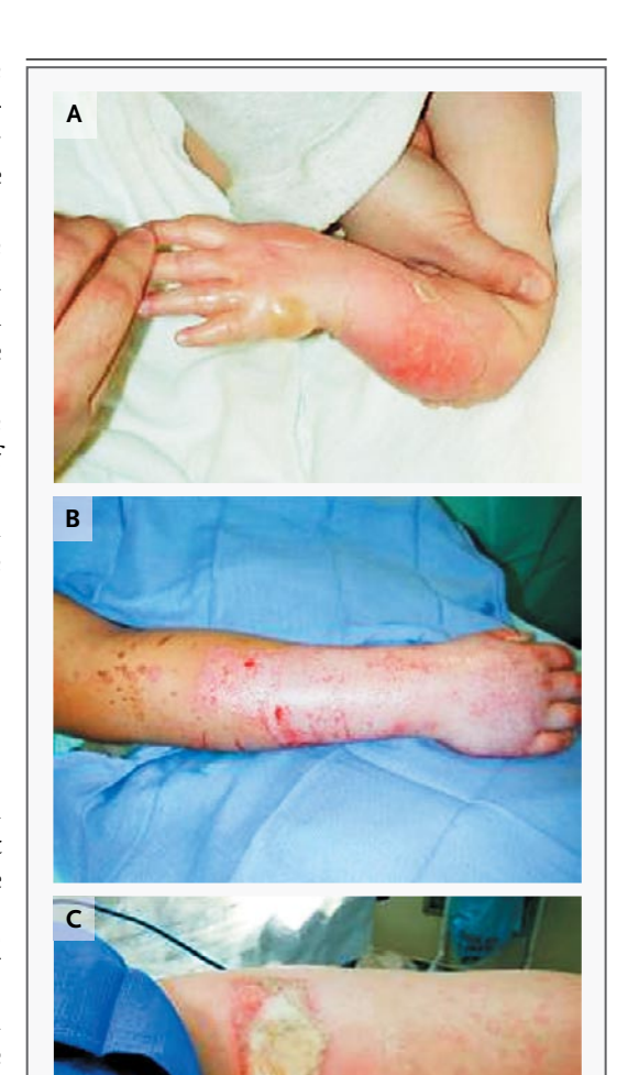
Figure 2. Determination of Burn Depth. A superficial second-degree burn is shown in Panel A, a deep second-degree burn in Panel B, and a third-degree burn in Panel C.

The debate regarding the removal of burn blisters has been fueled by conflicting data regarding the in vitro effects of blister fluid. Two clinical trials involving patients and volunteers with superficial burns demonstrated that intact blisters healed faster and were less likely to become infected than blisters that were ruptured. <sup>48,49</sup> These results are supported by a study in pigs, in which removal of the necrotic epidermis slowed reepithelialization and increased the rate of infection and scarring. <sup>50</sup> Blisters larger than 3 cm in diameter and those over mobile areas usually rupture spontaneously and may be aspirated under sterile conditions. <sup>48</sup> When blisters rupture,