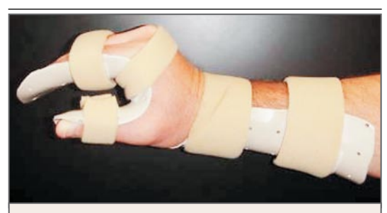
Figure 4. Position of Hand for Splinting Burns and Frostbites of the Hand.

particles. <sup>62</sup> The important exception to the treatment of a chemical burn with water lavage involves injury from the elemental metals (i.e., lithium, sodium, magnesium, and potassium), which spontaneously ignite with water. Exposure to hydrofluoric acid, which is used in etching and rust removal, leads to intense pain and tissue damage. <sup>62,63</sup> Treatment includes copious irrigation followed by the application of calcium gluconate gel or subcutaneous injection of calcium gluconate, with the goal of relieving the pain. A burn from hydrofluoric acid that involves more than 5% of total body-surface area, or more than 1% of total body-surface area if the concentration of hydrofluoric acid is greater than 50%, requires