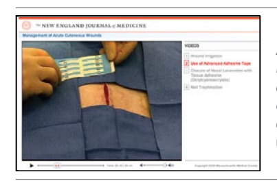
A video showing management of acute cutaneous wounds is available at www.nejm.org.