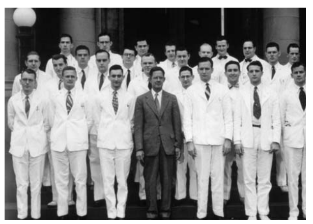
Fig. 2 Surgical house staff of Johns Hopkins University, 1950. Alfred Blalock is shown in the center of the photo with chief resident Denton Cooley on his left. Reprinted from Tex Heart Inst J, 2001.<sup>4</sup>

for cerebral protection. Total excision of the aortic arch and replacement with a custom-made Ivalon prosthesis was performed. After the reconstruction, the temporary shunt was removed. The procedure went smoothly; however, the right carotid shunt became occluded for 8 minutes before flow could be restored. The patient sustained a stroke and later died. In the discussion of the paper, Cooley recommended the use of heparin in the future and felt that hypothermia had been partially protective.