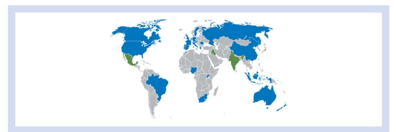
Fig 1. Countries participating in the International Surgical Outcomes Study. Blue: countries included in the primary analysis. Green: countries with <10 participating hospitals included in the secondary analysis.

and median [interquartile range (IQR)] for continuous data, number (%) for binary data, or odds ratios (ORs) with 95% confidence intervals (CIs). Analyses were performed using Stata 14 (StataCorp, College Station, TX, USA).