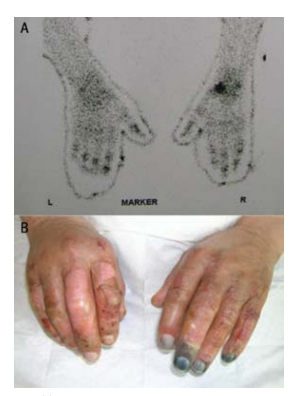
Fig 3 | (A) Technetium 99 scans of the hands of a patient with frostbite. The terminal digits have reduced signal (especially in the left hand), suggesting that substantial tissue necrosis has occurred. (B) Clinical picture after a five day iloprost infusion showing the close correlation between the initial technetium 99 scans and the subsequent clinical appearance

None of these investigations can accurately predict outcome in isolation, but they may be useful adjuncts to clinical examination in difficult or severe cases.