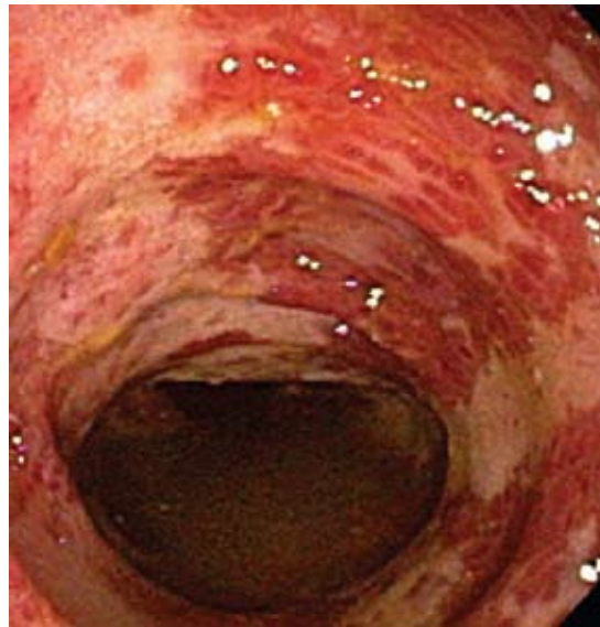
FIGURE 3. Severely active ischemic colitis with extensive ulceration and submucosal hemorrhage distributed segmentally in the distal transverse colon and descending colon.

Drugs should always be considered as possible culprits