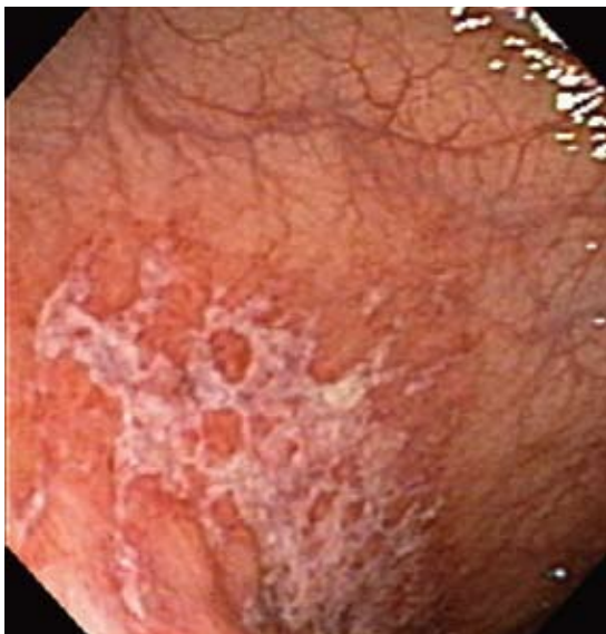
FIGURE 2. Mildly active ischemic colitis with a large superficial ulcer in the watershed area of the splenic flexure.