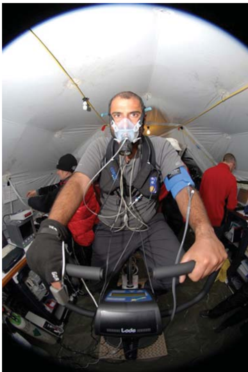
Fig 2 Detailed physiological measurement—cardiopulmonary exercise testing at altitude. Caudwell Xtreme Everest (2007).

Many of the original research papers referenced in this article, relevant reviews, further discussion, and future planned projects can be found in the publications section of the Caudwell Xtreme Everest website: www.xtreme-everest.co.uk .