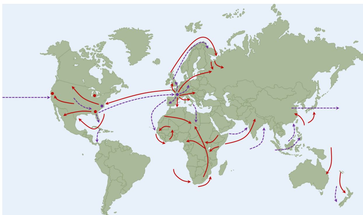
Fig. 2 The First and Second Waves of the 1918–1919 Pandemic First outbreaks and foci of second waves of the pandemic are labeled as red and purple circles, respectively. The lines of spread of the first and second waves of the pandemic are labeled as purple dashed lines and red solid lines, respectively. Map images were derived and/or modified from Servier Medical Arts under a Creative Commons Attribution 3.0 Unported License. Adapted from Nicholson et al. [80]

In mid-August of 1918, reports suggesting a second wave of this severe illness began to surface [35]. In some regions, primarily Northern Europe, the period between the end of the first wave and the beginning of the second wave was incredibly short, making the two waves almost indistinguishable [4, 42]. This second wave, occurring from September–November 1918, was responsible for the majority of illnesses and fatalities associated with the pandemic. Although the origins of the first wave