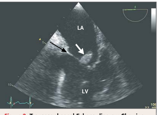
Figure 2. Transesophageal Echocardiogram Showing a Large Vegetation on a Native Aortic Valve. A large vegetation (white arrow) can be seen near the mitral valve (black arrow). LA denotes left atrium, and LV left ventricle.

Among aminoglycosides, only gentamicin has been fully evaluated for the treatment of infective endocarditis and should be used when the disease is caused by gram-positive cocci. Clinical