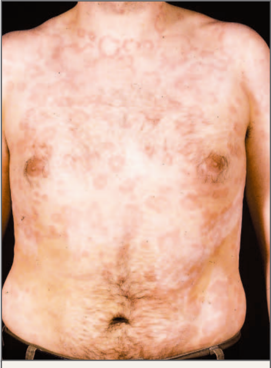
Figure 3. Urticaria Associated with Ampicillin Allergy.

Skin testing is highly accurate for the identification of penicillin allergy, however. The clinically relevant antigenic determinants for penicillin are well characterized and include the important penicillin determinant penicilloyl polylysine and multiple minor determinants. Skin testing is performed with penicilloyl polylysine and either penicillin G diluted to 10,000 U per milliliter or a mixture of minor determinants that usually includes a 10<sup>-2</sup> M mixture of benzyl penicilloate, benzyl penilloate, and benzyl-n-propylamine.<sup>29</sup> Skin-prick testing with full-strength materials is done first, and if these tests are negative at 15 minutes, they are followed by intracutaneous testing. An increase in the wheal diameter of at least 3 mm (as compared with the negative control) in the presence of erythema constitutes a positive test. Less than 20 percent of patients who report a history of penicillin allergy have detectable penicillin-specific IgE antibodies at the time of testing.<sup>30-32</sup> Negative skin testing indicates that the previous reaction was not IgE-mediated or that the antibodies are no longer present; in either case, penicillin can be administered again