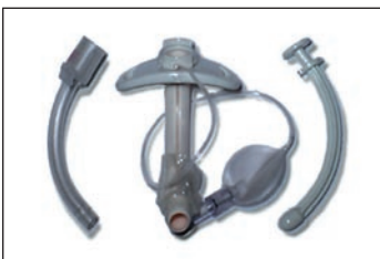
Figure 1. Components of the Tracheostomy Tube.

A 6-mm endotracheal tube can be used as an alternative to the tracheostomy tube, but this option is much less preferable because an endotracheal tube is more difficult to secure to the patient's neck. Endotracheal tube holders or other devices may be used to help secure an endotracheal tube to the neck. Another advantage of the tracheostomy tube is that it is shorter than an endotracheal tube and therefore easier to suction. 7