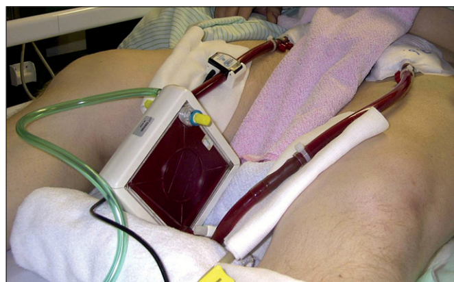
Figure 2 AV-ECCO 2 R (Novalung iLA®).

artery and the contralateral femoral vein using a percutaneously inserted cannula. If necessary, unilateral placement is possible, as is proning a patient with the device in situ .