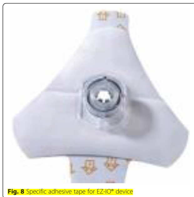
Fig. 8 Specific adhesive tape for EZ-IO® device

Besides the inability to insert the needle or a subsequent displacement, complications of IO insertion are uncommon, lower than 1 % of insertions. Compartment syndrome due to extravasation of fluid is the most common complication. If the needle has been inserted without