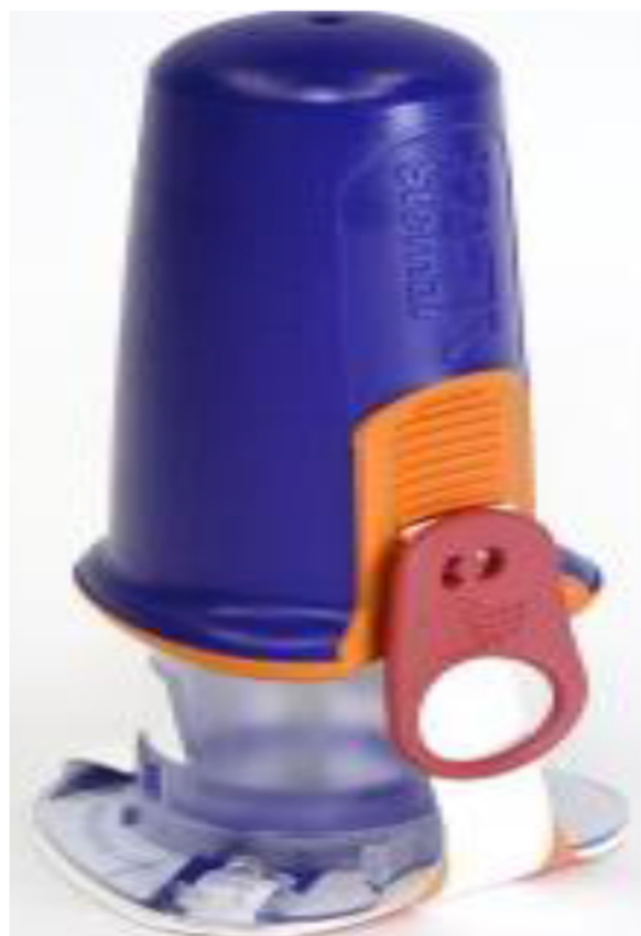
Fig. 5 FASTx® device