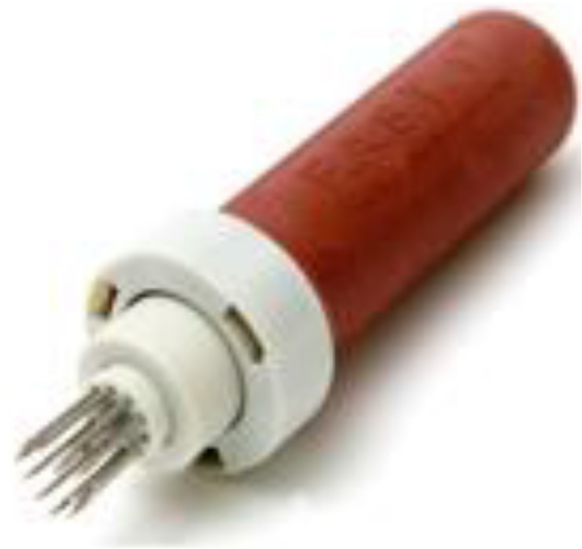
Fig. 4 FAST1® device