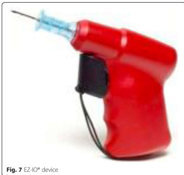
Fig. 7 EZ-IO® device

Despite a large amount of literature on the subject, there is no clear recommendation for one device over another in a given situation. In fact, comparative studies were conducted on cadaver models [18], very far from a real emergency scene, where stress is a confounding variable of performance. Furthermore, studies on patients are rarely prospective and include only a small number of patients. In one recent randomized controlled trial study comparing different devices in 107 adults, the success rate on first attempt was higher (92 % vs 83 %,