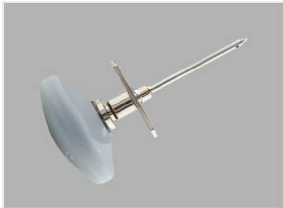
Fig. 2 Dieckmann modified needle

USA) – and one is re-disposable – the EZ-IO® (Fig. 7). The latter is a power driver with sealed lithium batteries enabling approximately 1000 insertions (EZ-IO® Power Driver 9050) (Teleflex, Limerick, PA, USA) or 500 insertions for the newest and smaller version (EZ-IO® G3 Power Driver 9058) without needing to charge the batteries.