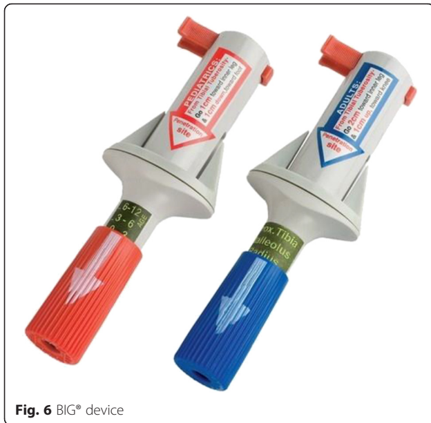
Fig. 6 BIG® device

in the bone. When the needle is inserted with EZ-IO®, the operator drills the needle with the power driver into the bone perpendicular to the insertion site.