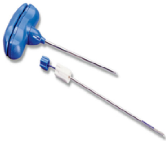
Fig. 3 Jamshidi needle

When a physician practices the manual IO access procedure, he/she has to ensure a safety guard on the needle of 1 cm with thumb-index and realize an axial twisting motion to insert the needle in the bone. If the needle is inserted with the FAST®, the insertion site is located just below the sternal notch. The operator holds the introducer perpendicular to the manubrium and presses down until the needle is released. When BIG® is used, the operator holds it firmly to avoid the projection up of the needle perpendicular to the insertion site, squeezes the safety latch and pushes to eject the needle