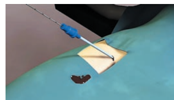
Figure 3. Advancing the Dilator to Make a Tract.