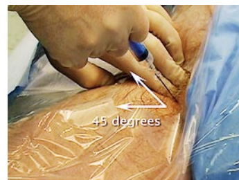
Figure 1. Inserting the Introducer Needle.

Several studies have shown that using ultrasonography to assist in central-catheter placement increases success and reduces complications. 2,3 Choose a linear probe rather than a curved probe for femoral catheter placement. Linear probes emit high-frequency waves that are optimal for viewing superficial structures, such as the femoral vessels. Position yourself toward the patient's feet, and place the ultrasound monitor in front of you. Orient the probe so that the patient's right is on the right side of the screen. Place the probe in a sterile sheath with coupling gel inside. Sterile gel can be applied to the outside of the protective covering. Placing the patient in a reverse Trendelenberg position engorges the femoral vein and may aid in visualization. Ultrasound imaging renders vessel walls brighter than their lumens, which are filled with blood. The femoral vein is collapsible as compared with the artery. Use of the Doppler function of the ultrasound machine may help distinguish pulsatile (arterial) from more continuous (venous) blood flow. Position the vein in the center of the screen, and insert the needle at the center of the probe (Fig. 4). After the ultrasound images indicate that the needle is in an appropriate position for entering the vein, you will also note the intravenous location by observing a flash of blood into the syringe.