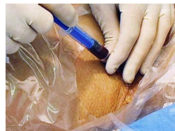
Figure 2. Anchoring the Needle.