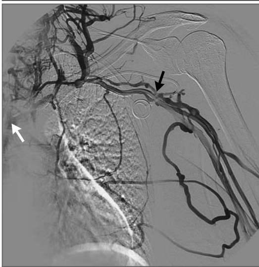
Figure 1. Conventional Digital Subtraction Phlebogram in a Patient with Catheter-Associated Deep-Vein Thrombosis of the Left Arm.

Obstructive filling defects are visible in the left brachiocephalic vein (white arrow indicates the tip of an implanted catheter) and continue as partial filling defects in the left subclavian and axillary veins (black arrow points to the distal thrombus extension). Extensive jugular collaterals can also be seen.