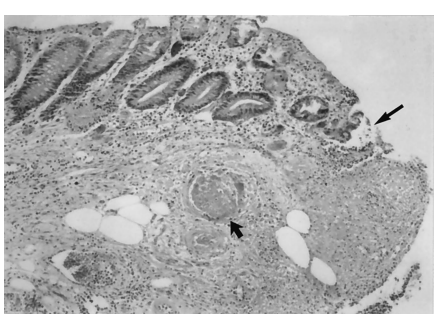
Figure 3. Photomicrograph of perforated sigmoid colon after a motor vehicle crash shows mucosal necrosis ( long arrow ) and submucosal inflammation with thrombosed submucosal blood vessel ( short arrow ). Preoperative diagnosis was blunt rupture of colon (hematoxylin and eosin, ×150)

with a constipating agent. Once through customs, they use laxatives or enemas to retrieve the packets in the stool. Each packet contains 3–7 g of cocaine, a fatal dose if a packet ruptures and the cocaine is absorbed. The ingested cocaine packets may also cause a mechanical bowel obstruction. Once ruptured, the surviving patient may experience all of the complications of cocaine toxicity, including giant gastric ulceration. Asymptomatic