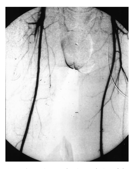
Figure 5. Arteriogram showing occlusion of the right profunda femoris artery in a patient with a right femur fracture after a motor vehicle crash. Subsequent rhabdomyolysis led to acute renal failure.

When named intraabdominal arteries become occluded, the mechanism of action is thought to be stasis in the vasovasorum leading to intimal injury and platelet aggregation. Treatment is deter-