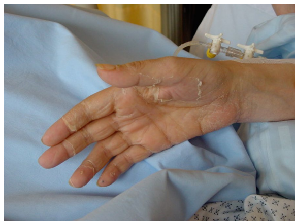
Fig. 1 Palmar desquamation occurring a few days after STSS

The third phase of clinical presentation is characterized by circulatory shock that can be sudden and profound, accompanied by multiple organ failure. Despite aggressive therapy many patients will die within 24–48 h of hospitalization.