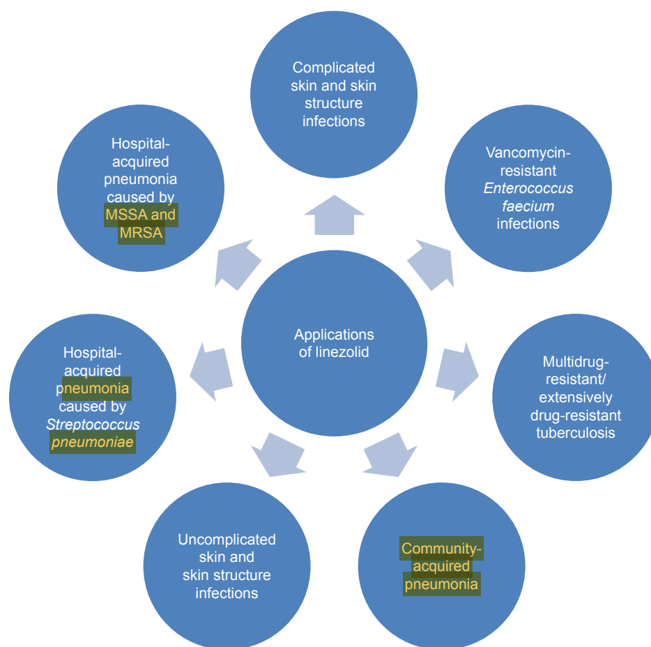
Figure 2 Pictorial representation of the linezolid applications.

Abbreviations: MSSA, methicillin-susceptible Staphylococcus aureus ; MRSA, methicillin-resistant S. aureus .