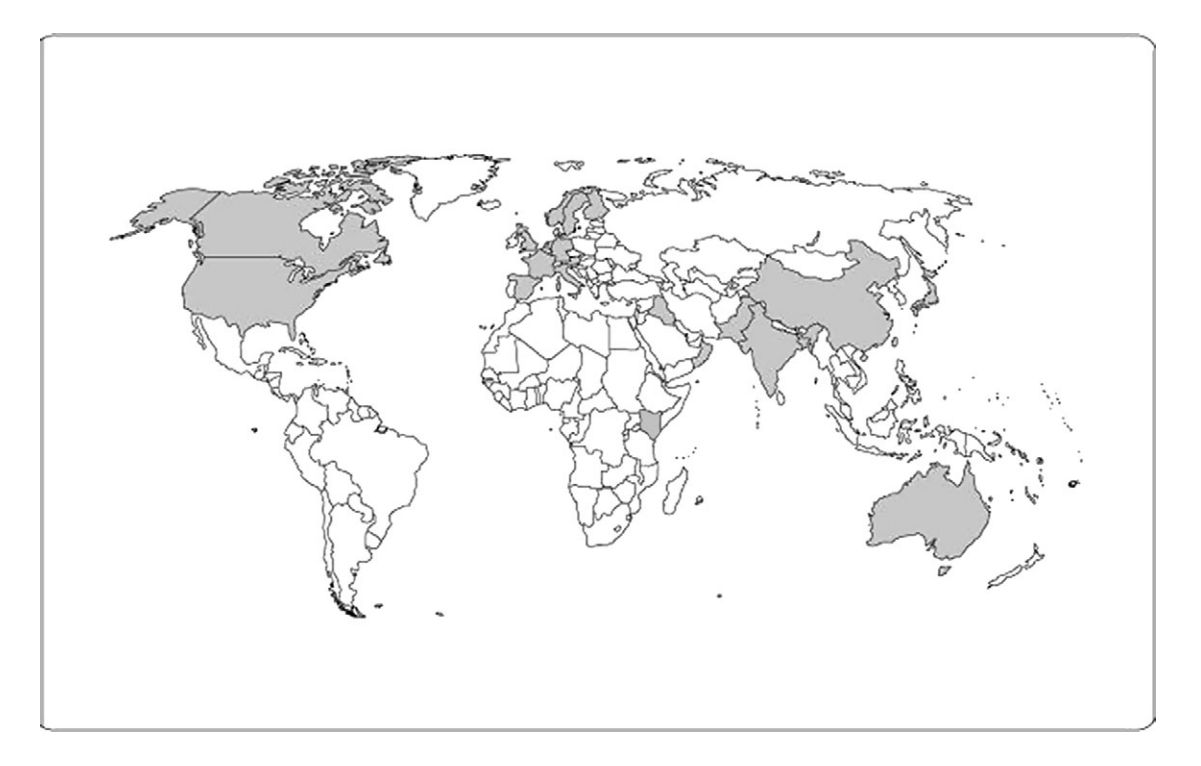
Figure 2. International dissemination of New Delhi metallo-β-lactamase (NDM)–producing Enterobacteriaceae . This map indicates countries where NDM-producing Enterobacteriaceae have been described in published reports available as of 11 February, 2011. Because of lack of systematic surveillance for these organisms, countries not highlighted in this figure might also have unreported NDM-producing Enterobacteriaceae .

to CDC for evaluation from January 2007 through October 2009, 312 (91%) had a colistin minimum inhibitory concentration (MIC) \leq 2\mu g/mL , and 304 (88%) had a tigecycline MIC \leq 2\mu g/mL . Only 2 isolates were nonsusceptible to both colistin and tigecycline (unpublished CDC data). "Pan-resistance" to antimicrobials agents has also been reported [21].