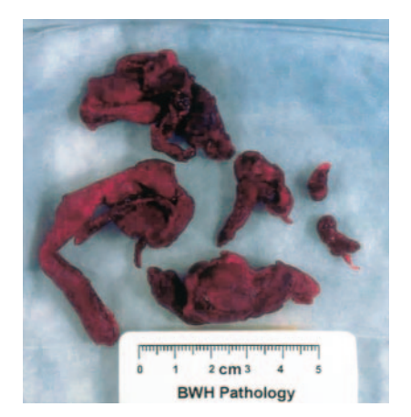
Figure 1. This pulmonary embolectomy specimen measures 11 \times 6 \times 1.5 cm in aggregate.

tion and dilatation but can also exclude diagnoses that may mimic PE such as aortic dissection, pericardial tamponade, or acute myocardial infarction. The echocardiogram can also diagnose complications of PE such as right heart thrombi or even show thrombus protruding into the left atrium via a patent foramen ovale or atrial septal defect.6 In patients with poor image quality of the right ventricle or in those who undergo cardiopulmonary resuscitation, transesophageal echocardiography may be used.7 In patients who can be stabilized with fluids, pressors, or mechanical ventilation, a contrastenhanced chest CT will demonstrate filling defects in the main or lobar pulmonary arteries, as well as right ventricular enlargement on the reconstructed CT 4-chamber view.8