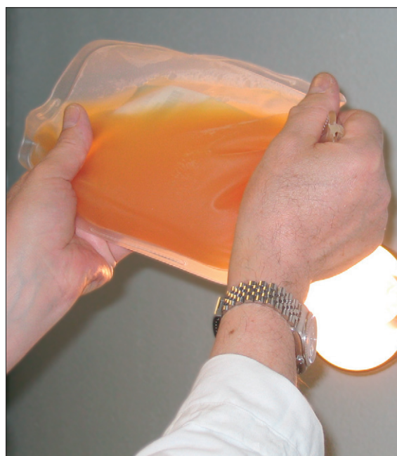
Figure 2: Swirling to judge platelet quality

Traditionally, platelets were administered prophylactically when a patient's platelet count fell below 20 000 platelets per \mu\text{L} . 39 This practice was challenged in 1991 when Gmür and colleagues 40 reported their 10-year transfusion study in 103 leukaemic patients. Stable patients were transfused prophylactically at a count of 5000 platelets per \mu\text{L} or less; patients with fresh minor haemorrhage or body temperature higher than 38°C were transfused at 6000–10 000 platelets per \mu\text{L} ;