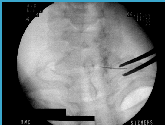
Dispersion of contrast following phenol injection

from intravascular injection. All of these cases come from the medical-legal arena and have not been reported in the medical literature. Kyzelshytin (personal communication) presented anatomical dissections done after injection of contrast and methylene blue. He found that, with C6, dye spreads to the mediastinum and across to the contralateral side because the injectate is deposited behind the longus colli muscle. Volumes recommended for stellate ganglion blocks using the C6 approach are in the 10-15 ml volume range. Injections are made in the vicinity of not only the vertebral artery and the nerve roots but also near arteries in the posterior neuroforamin. The C6 transverse process may be absent, allowing the needle to enter the posterior wall of the neuroforamin canal and reach the arteries described by Huntoon. Chassaignac's tubercle generally is easily recognizable, but clearly the tip of a sharp needle can enter structures leading to the disasters that occur with an unacceptable frequency. Landmarks are more certain, which makes injection into blood vessels less likely, and smaller volumes of local anesthetic are required for the C7 versus C6 approach. Thus the C7 approach is safer. I recommend the C7 image-guided technique for stellate ganglion block.