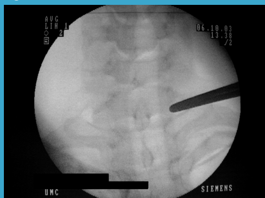
Radiopaque instrument marking the target site.