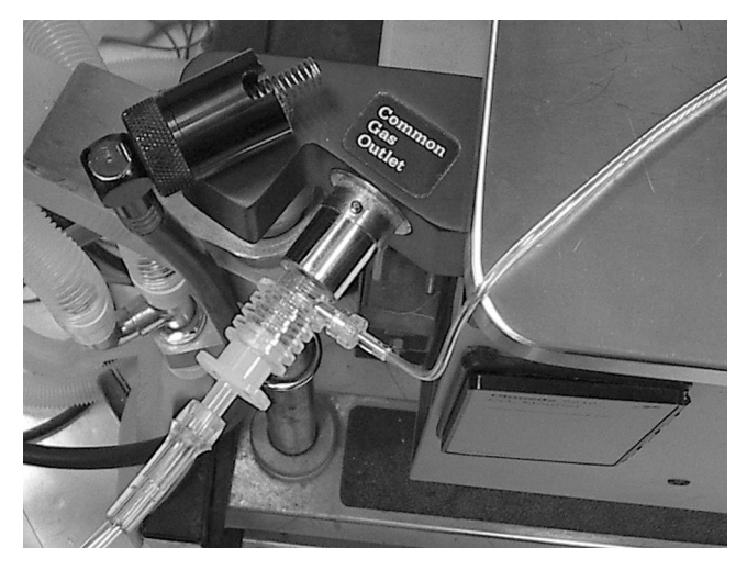
Figure 3. A nasal cannula mated to a common gas outlet via a 5-mm endotracheal tube connector and a gas sampling connector with a gas sampling line attached.