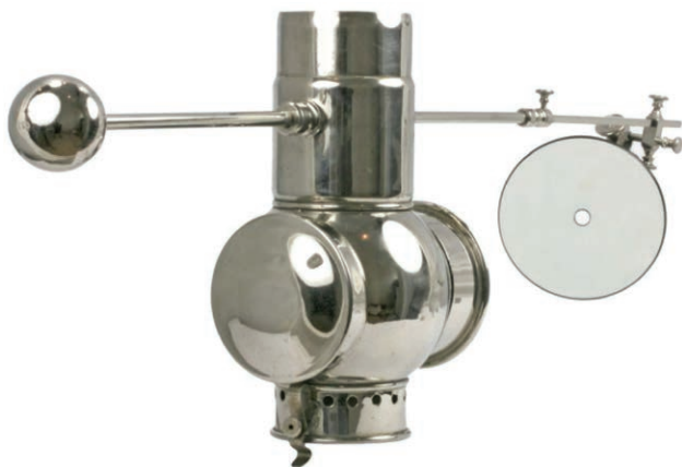
Figure 1. Image of the Boekel's laryngoscope, invented in 1886. An oil lamp was used as the light source. The operator looked through the hole in the mirror on the right into the larynx, which was illuminated by light being focused through the lens in the middle of the device.

Compared to viewing the larynx from outside the oral cavity by a direct line of sight approach with direct laryngoscopy, video laryngoscopes provide an indirect view by having a camera lens close to the tip of the blade nearer to the larynx. This results in a much wider angle of view compared to direct laryngoscopy. 8 Unlike direct laryngoscope blades, which contain a fiberoptic, xenon halogen, or light-emitting diode light source that runs the length of the blade, video laryngoscope blades contain a recessed light source and a camera generally positioned in the middle of the blade (Figure 3). The light source and camera are powered either from the monitor (Glidescope [Verathon Medical, Bothell, WA]; Storz C-MAC [Karl Storz, Tuttlingen, Germany] or by an internal battery (King [Ambu, Ballerup, Denmark]; McGrath [Medtronic, Minneapolis, MN]; Co-Pilot [Magaw