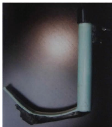
Used the CMOS camera epoxied on to the single use blade with 3 LEDs.