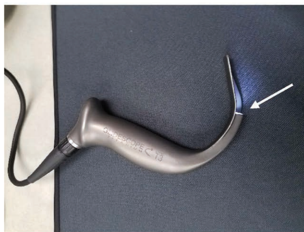
Figure 3. Mcgrath video laryngoscope with attached X Blade (left) and Glidescope video laryngoscope with reusable titanium angulated blade (right). Arrows indicate location of recessed light source and camera.