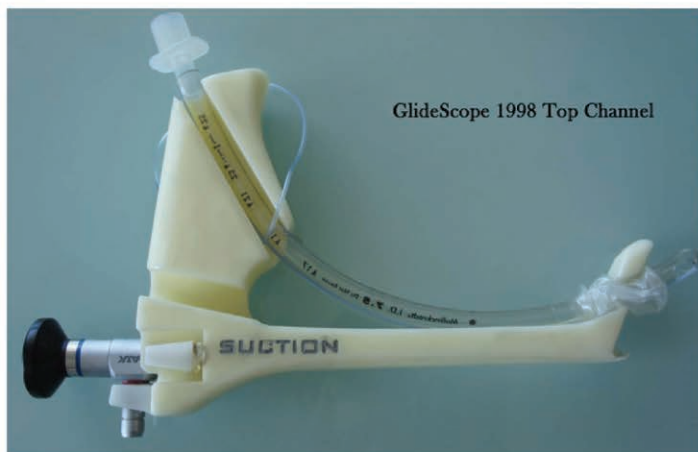
This precursor used a 45 degree arthroscope but was never introduced in the market.