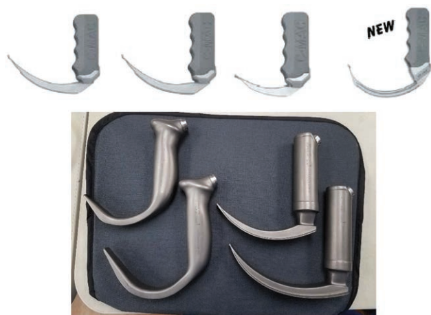
Figure 5. Top, Karl Storz C-MAC blades: Macintosh 3, 4, 2, and D blades from left to right. Bottom, Verathon Glidescope Titanium blades: size 3 (top left) and 4 (bottom left) angulated blades, Macintosh 3 (top right) and 4 (bottom right) blades.

Titanium line and disposable blades with a reusable cable in its Cobalt AVL and Ranger lines. Storz (C-MAC) also offers both reusable blades and disposable blades (with a reusable cable). The McGrath, Pentax AWS, CoPilot VL, and King video laryngoscopes have reusable handles with single-use disposable blades, and the Airtraq is fully disposable with an optional reusable camera attachment.