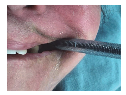
FIGURE 2: Postretromolar intubation showing tracheal tube in contact only with the last molars.

tube was removed. All the teeth were accounted for and no dental damage was detected.