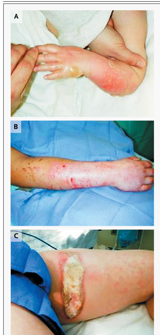
Figure 2. Determination of Burn Depth.

The debate regarding the removal of burn blisters has been fueled by conflicting data regarding the in vitro effects of blister fluid. Two clinical trials involving patients and volunteers with superficial burns demonstrated that intact blisters healed faster and were less likely to become infected than blisters that were ruptured. 48,49 These results are supported by a study in pigs, in which removal of the necrotic epidermis slowed reepithelialization and increased the rate of infection and scarring. 50 Blisters larger than 3 cm in diameter and those over mobile areas usually rupture spontaneously and may be aspirated under sterile conditions. 48 When blisters rupture,