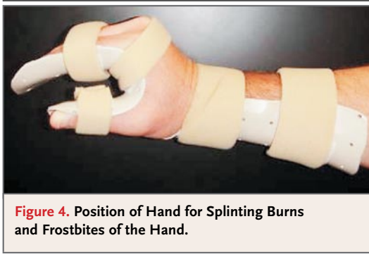
Figure 4. Position of Hand for Splinting Burns and Frostbites of the Hand.

particles. 62 The important exception to the treatment of a chemical burn with water lavage involves injury from the elemental metals (i.e., lithium, sodium, magnesium, and potassium), which spontaneously ignite with water. Exposure to hydrofluoric acid, which is used in etching and rust removal, leads to intense pain and tissue damage. 62,63 Treatment includes copious irrigation followed by the application of calcium gluconate gel or subcutaneous injection of calcium gluconate, with the goal of relieving the pain. A burn from hydrofluoric acid that involves more than 5% of total body-surface area, or more than 1% of total body-surface area if the concentration of hydrofluoric acid is greater than 50%, requires