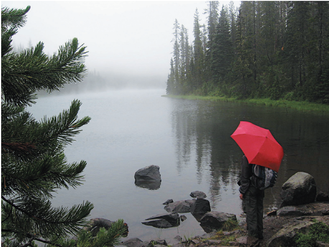
Duffy Lake, Oregon

Copyright © 2010 Massachusetts Medical Society.