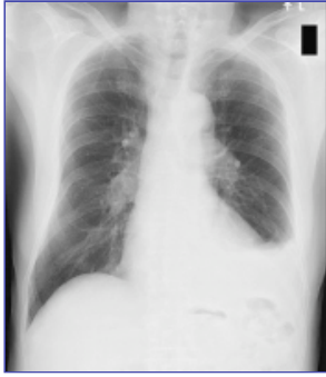
Chest radiograph showing left-sided pleural effusion.