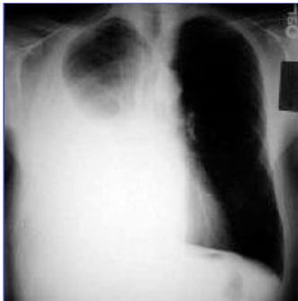
Large, malignant, right-sided pleural effusion.

The normal pleural space contains approximately 1 mL of fluid, representing the balance between (1) hydrostatic and oncotic forces in the visceral and parietal pleural vessels and (2) extensive lymphatic drainage. Pleural effusions result from disruption of this balance.