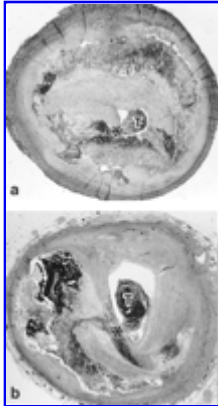
Figure 1. Two typical examples of acute coronary occlusions in fatal ischemic events. Note that with respect to cross-sectional area measurement of stenosis (a, 97%; b, 90%), there is severe underlying atherosclerosis at the site of plaque rupture and thrombosis (asterisk indicates rupture site; T, thrombus) (hematoxylin-eosin; magnification x17).

[in this window] of Occlusive Thrombosis* (Cross-sectional Area Narrowing) [in a new window]